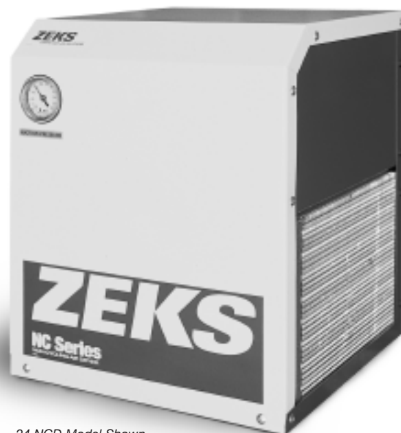
24 NCD Model Shown