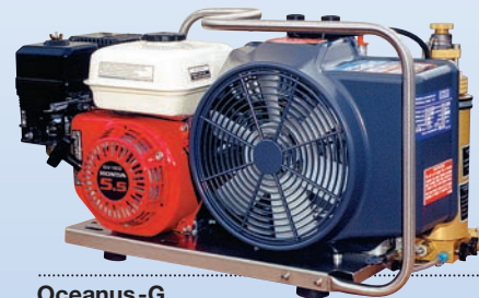
Oceanus-G Shown with Optional HONDA Gasoline Engine Drive